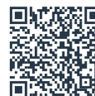
Table "Spacings and edge distances - ETA-10/0074" cannot be displayed : no references available.

Spacings and edge distances - ETA-10/0074