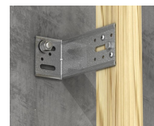
Connect timber battens.