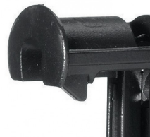
Nez lisse permettant de ne pas endommager la surface de la plaque de plâtre.