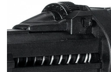
Molette de réglage de la pénétration de la tête de la vis dans le support.